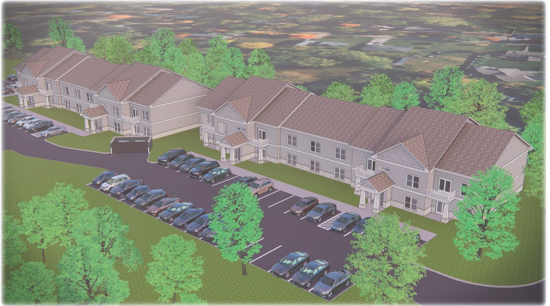
THE FARM APARTMENTS ANN ARBOR, MICHIGAN